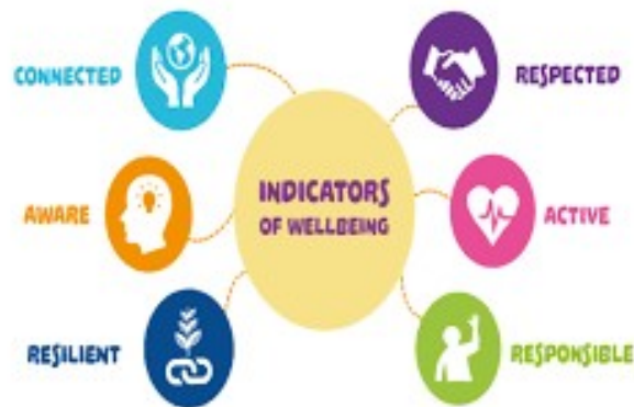
Figure 3.1 Indicators of Well-Being (JCT.ie)

It will encourage students to develop a strong sense of connectedness to their school and their community. The indicators for wellbeing as outlined in the new framework for Junior Cycle (see figure 3.1) underpin C.P.PS's curricular provision for well-being.