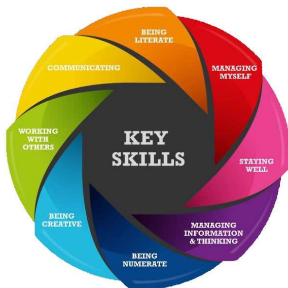
(Figure 8.1 Junior Cycle Key Skills)

The framework for Junior Cycle is underpinned by 24 statements of learning (SOL's). Eight key skills are outlined within the framework (see figure 8.1), one of which is 'staying well' suggesting the weight of importance wellbeing holds within the new framework